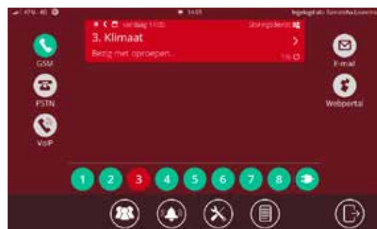
Display of your alert.

With 4 decades of experience, Adésys is the telephone alert specialist. This 5th-generation Octalarm uses the latest technology to enable secure and reliable alerts using today's (significantly changed) digital telephone networks. With Octalarm-Touch, you're ready for the future!