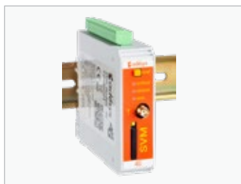
SVM 4G modem